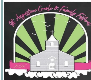
Actual T-Shirt design. (Black shirt with white, pink, green & grey ink)

Get your Official St. Augustine Creole & Family Festival T-shirt early and at an early bird price special! Presales available until September 30, 2025 ONLY. See link: https://square.link/u/StUD8sv5