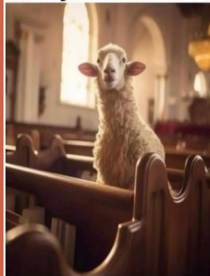
Jesus wants Ewe in a Pew